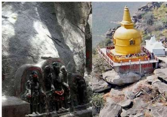
Pret Shila Mandir